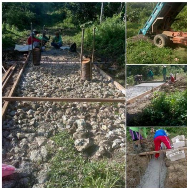
LUO Driveway Repair #1 project update:

Yes, the Lord God has done it again! 😊 Thank you to those who help in making the LUO's first construction of the much needed driveway repair possible. There are a total of 3 areas to be repaired, then the truck will have a better climb ~ 😊 If you are led by the Lord and you want to be a part of this project through prayer and financial support, God bless you! To support this project with your giving, please visit our website, lantawugma.org or its Facebook page and click on the 'Support LUO' button. Thank you! ❤️