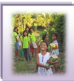
<u>Top Left</u>: A young teenage boy (one of LUO scholars) who couldn't read a single word in 2012 then enrolled in First Grade in June 2014, now is able and who enjoys reading God's Word! <u>Top Right</u>: Children enjoying walk on way home from fun-filled Bible study/activity at LUO site!